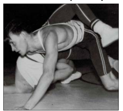
Wrestling in high school.

formed something of a band with a few others from the neighborhood. His sister says it lasted a couple years, but faded away as the kids went their separate ways.